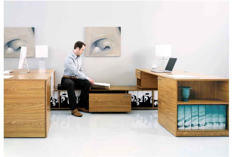
Multiple lateral, box, drawer, open and closed storage options keep materials easily accessible.