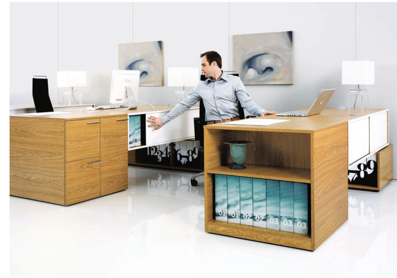
Discreet cabinets with sliding plexiglass doors can be accessed from the seated position.