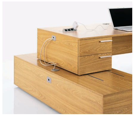
Built-in wire management channels keep wires discreetly organized and provide enough flex to push or pull the desk the entire length of the glide. CPU doors in perforated metal provide additional airflow.