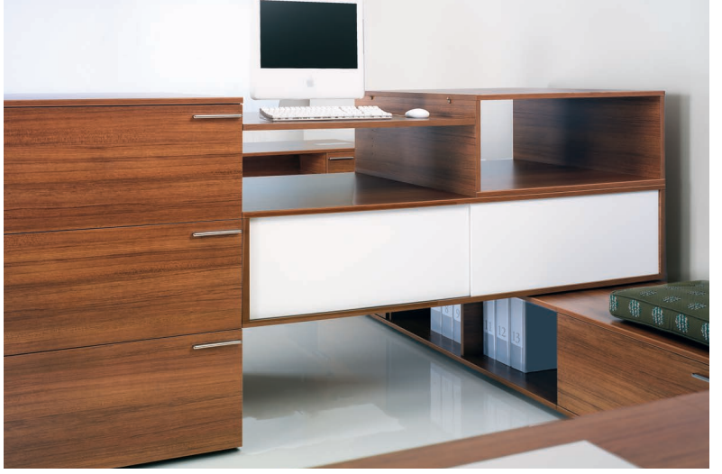
The Shared Center unit has an adjustable work surface to support both seated and standing tasks. Sliding plexiglass cabinet doors keep the workspace tidy.