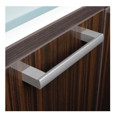
Please find additional product components and detail photos at www.in2-design.com