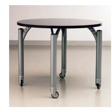
Please find additional product components and detail photos at www.in2-design.com